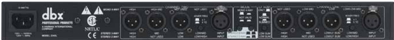
234 REAR PANEL